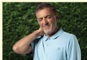
Feeling tired, fatigued