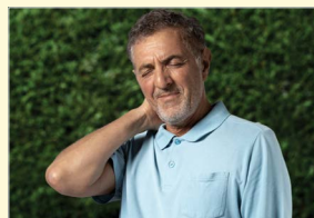
Feeling tired, fatigued