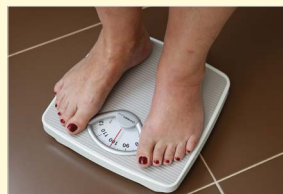
Rapid weight gain